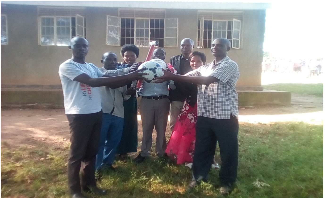
Pupils and the Staff Nyantungu Primary School in Bukiro Sub County receiving sports equipment from RTY.