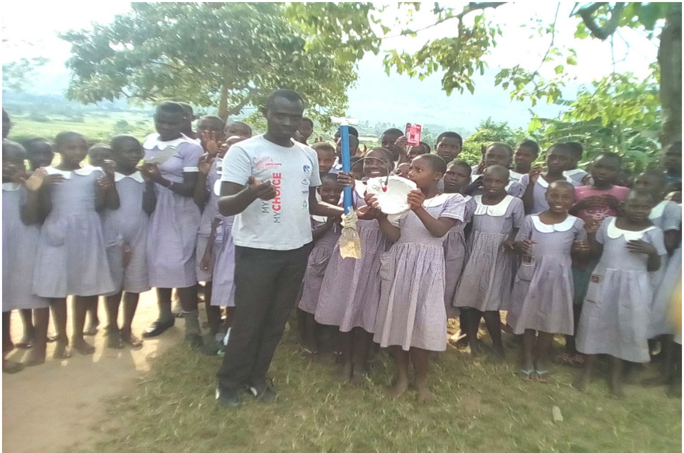
Pupils and the Staff Nyakayojo II Primary School in Rwanyamahembe Sub County receiving sports equipment from RTY.