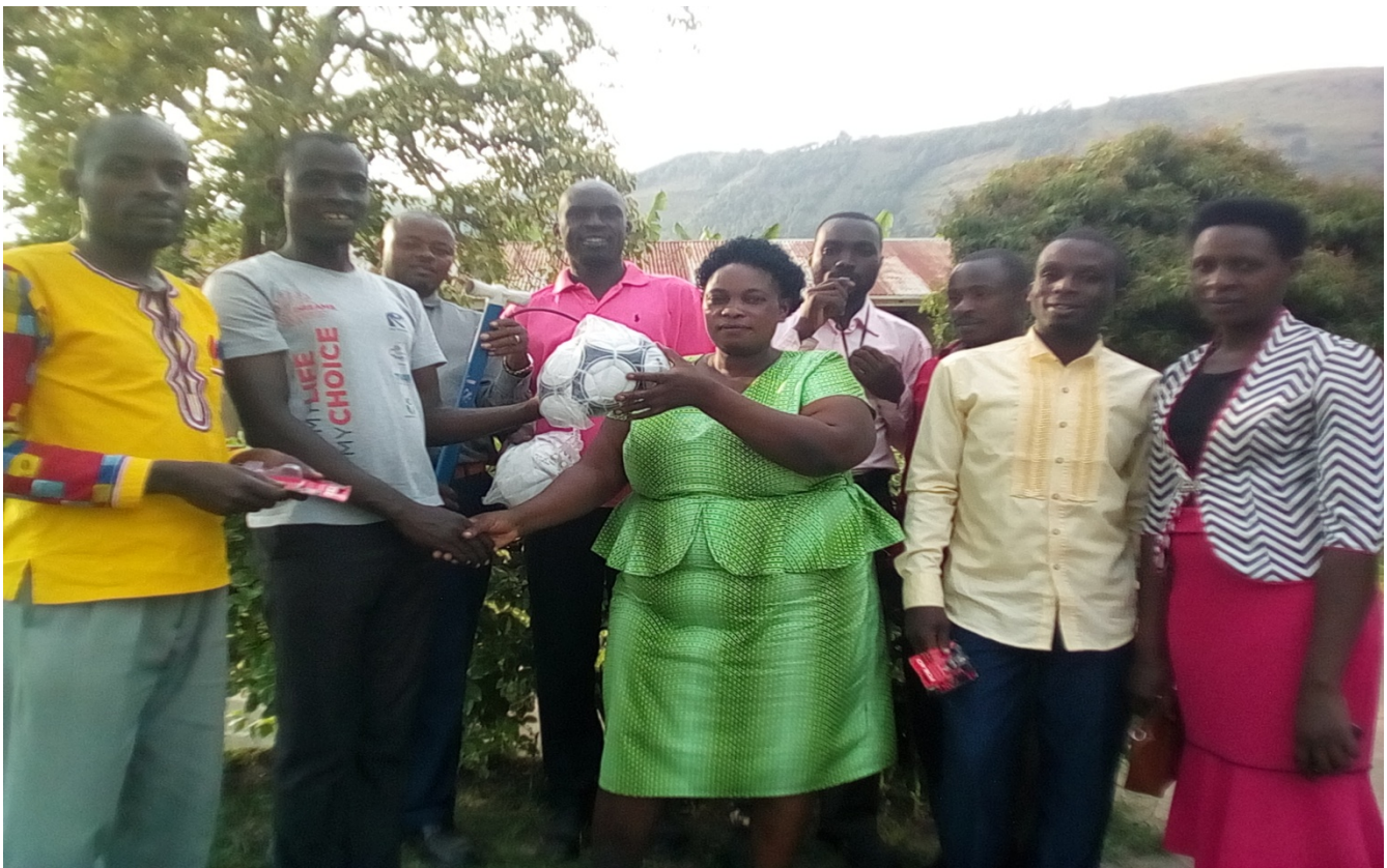
Pupils and the Staff Kitengure Primary School in Bukiro Sub County receiving sports equipment from RTY.