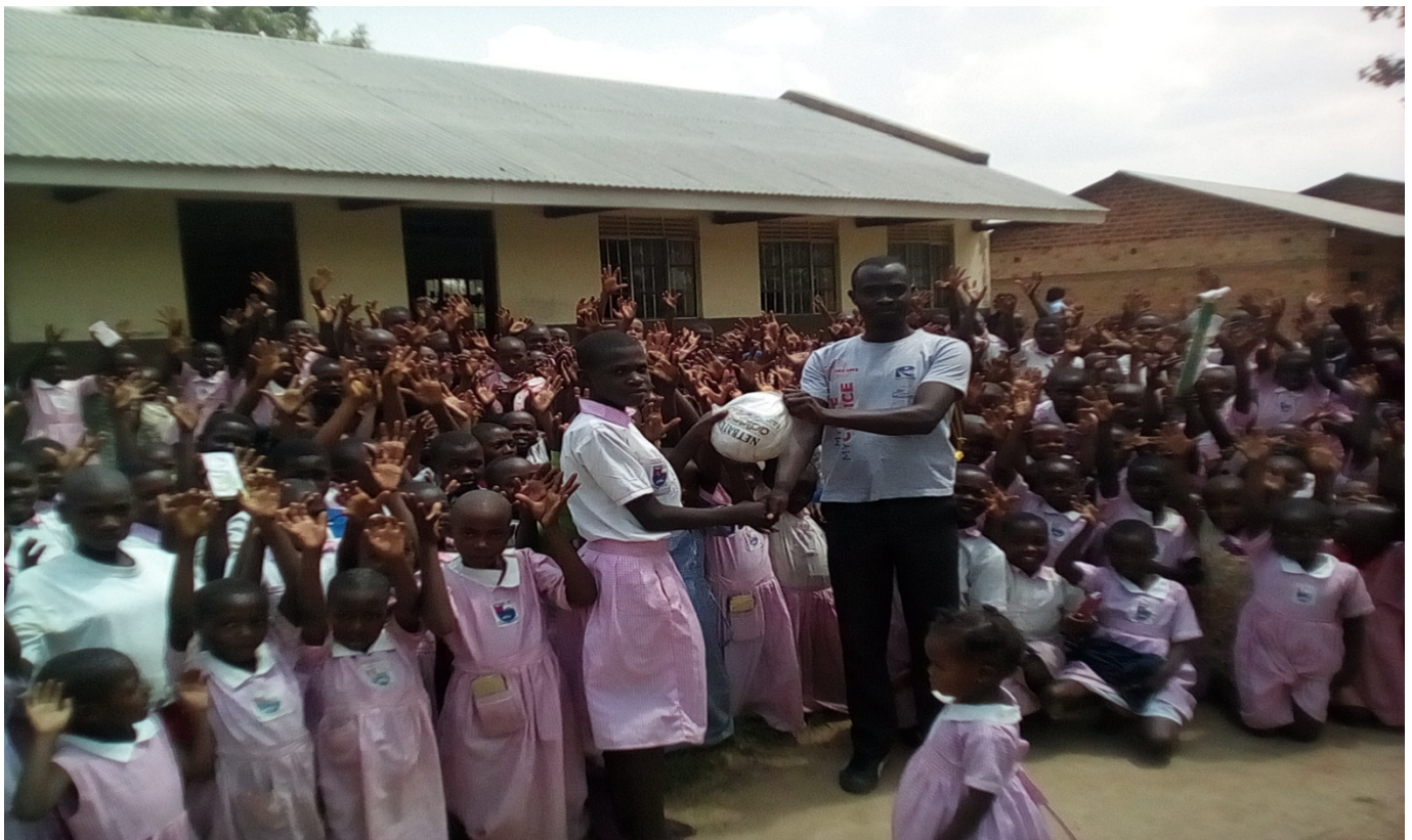
Pupils and the Staff Kaguhanzya Primary School in Rubaya Sub County receiving sports equipment from RTY.