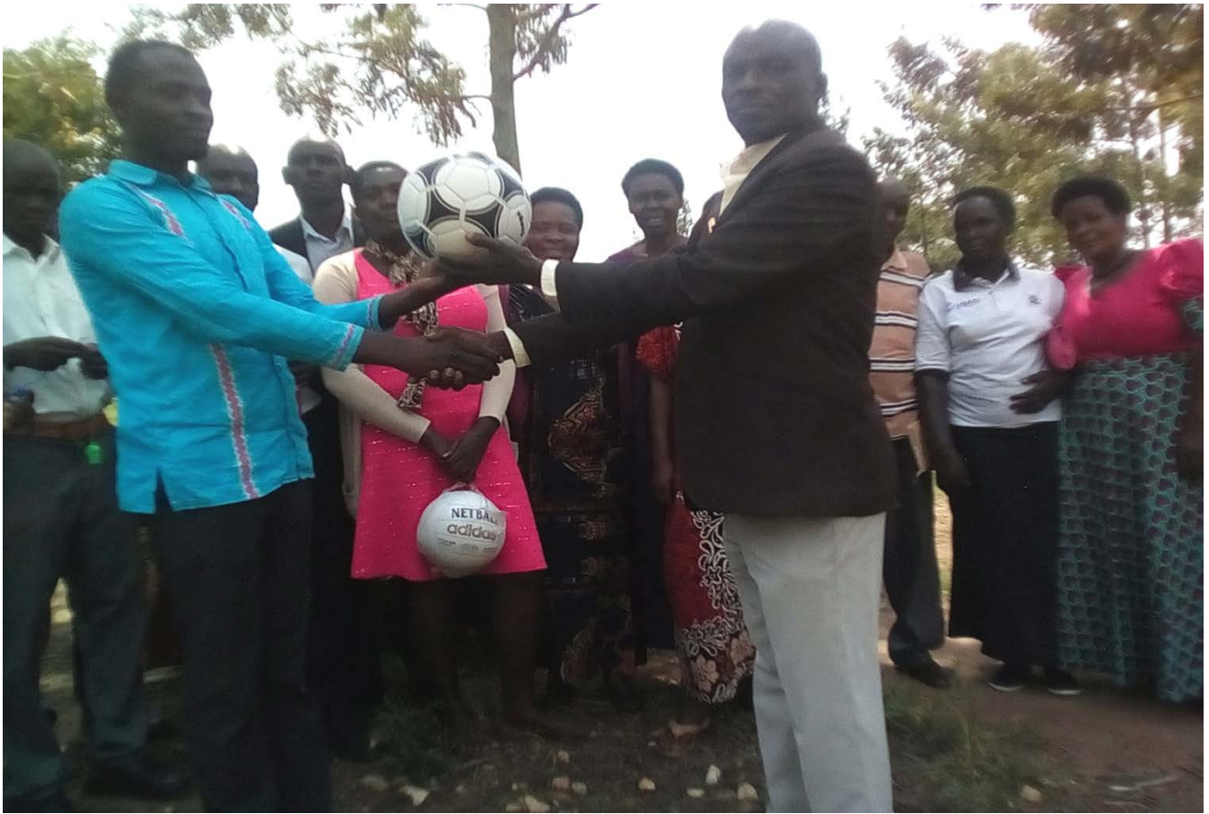
The above photos are of Male, Female Pupils and the Staff Itara Primary School in Rubaya Sub County receiving sports equipment from RTY.