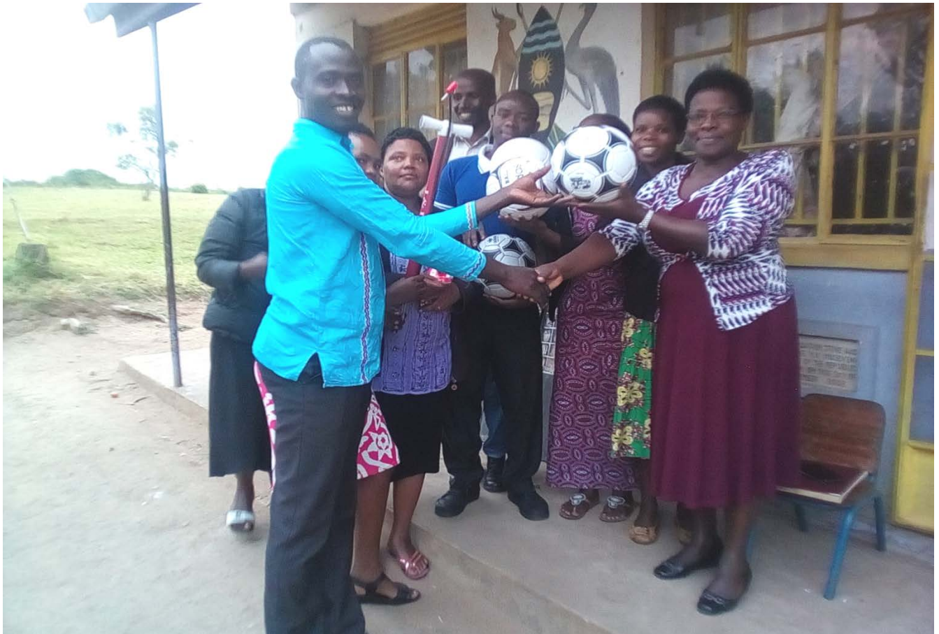
The above photos are of Male, Female Pupils and the Staff Esteeri Kokundeka Memorial Primary School in Rubaya Sub County receiving sports equipment from RTY.