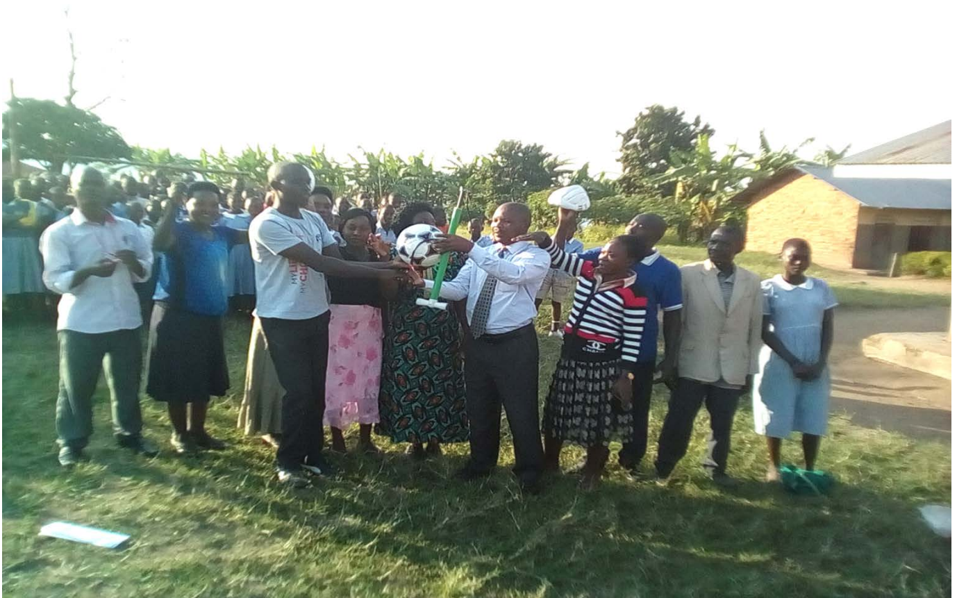
Pupils and the Staff Rubingo I Primary School in Bukiro Sub County receiving sports equipment from RTY.