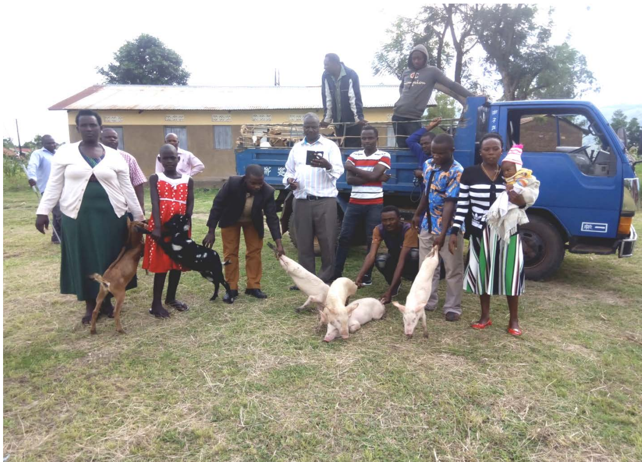
The figure 2C Shows Youth of Bukiro with their LCIII Chairperson in the middle pausing in the photo after receiving their animals.