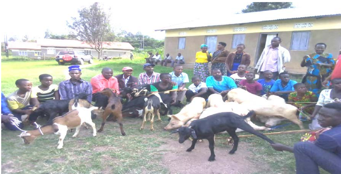
Figure 2A: Chairperson LC III Handing Over Piglets Youth in Bukiro Sub County enjoying looking at their goats and pigs