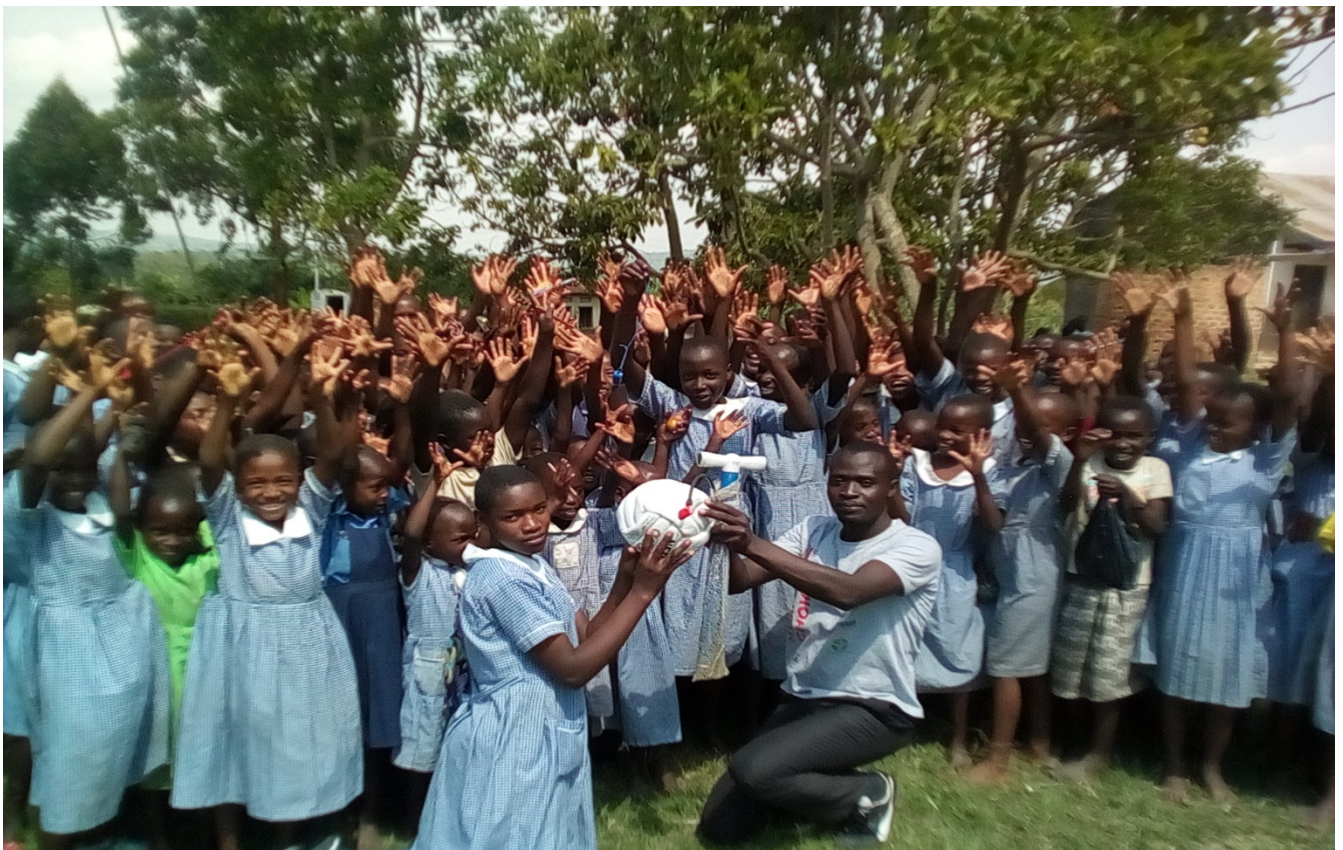
Pupils and the Staff Rutooma Modern Primary School in Rwanyamahembe Sub County receiving sports equipment from RTY.