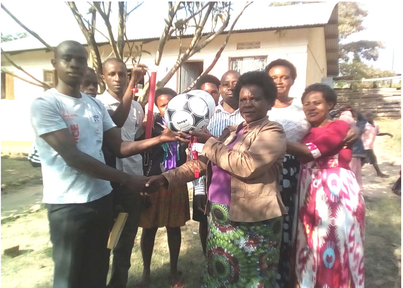
The above photos are of Male, Female Pupils and the Staff Bunenero Primary School in Rubaya Sub County receiving sports equipment from RTV.