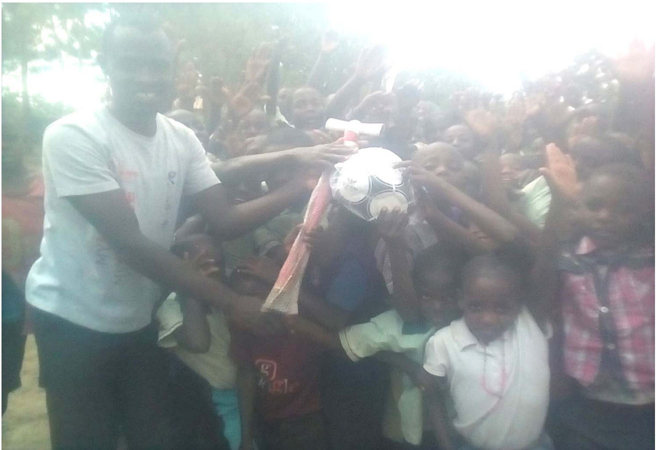
The above photos are of Male, Female Pupils and the Staff Buhumuriro Primary School in Rwanyamahembe receiving sports equipment from RTY.