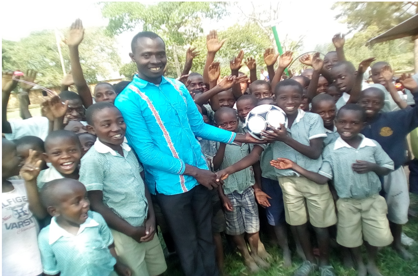
Pupils and the Staff Ruburara Primary School in Rubaya Subcounty receiving sports equipment from RTY.