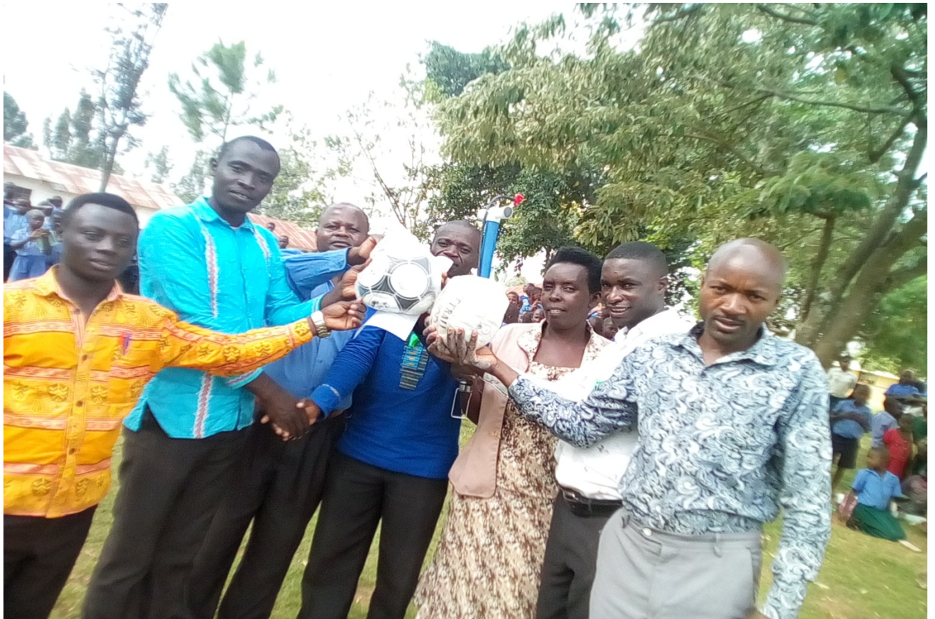
The above photos are of pupils and the Staff of Akashanda Primary School in Bukiro Subcounty receiving sports equipment from RTY.