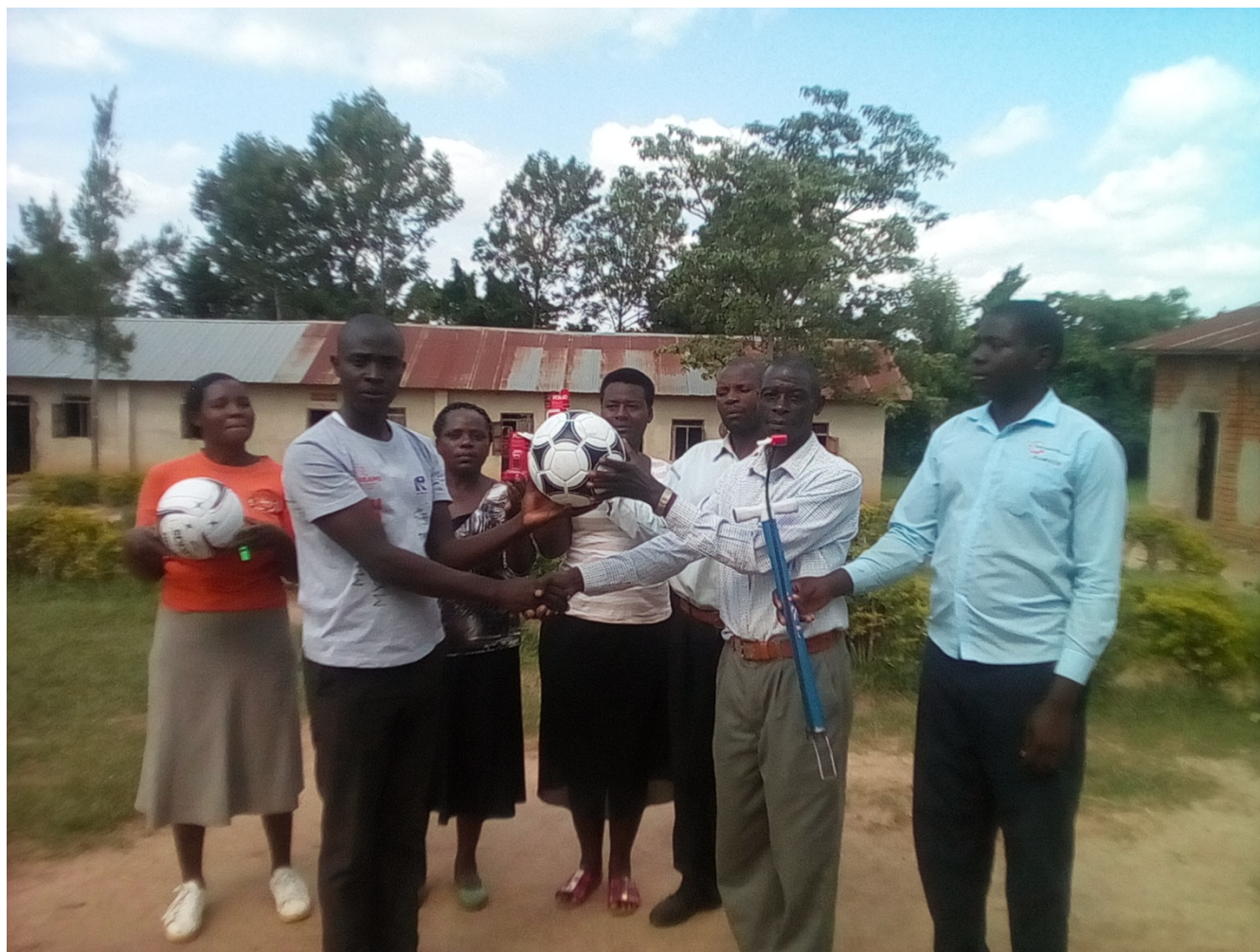
Pupils and the Staff Rwengwe Primary School in Bukiro Sub County receiving sports equipment from RTY.